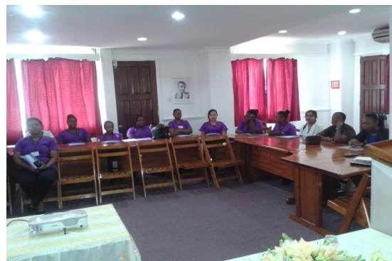
Rehab. Assistants & Practitioners on July 21, 2014 Orientation

A total of 18 Rehabilitation Assistants and 4 Audiology Practitioners are now apart of the Disability & Rehabilitation Services.