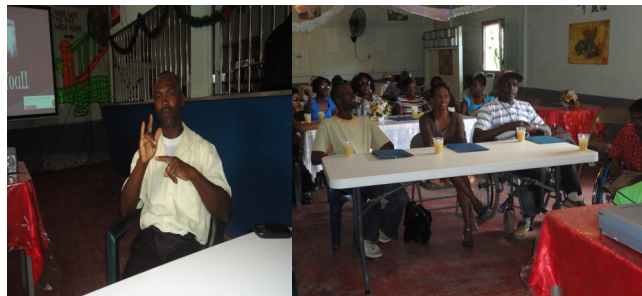
Sign Language interpreter & participants on Sept. 12, 2014