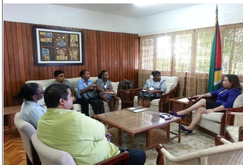
NCD Team at Meeting with Min. Of Foreign Affairs on July 30, 2014

The Hon. Minister of Foreign Affairs, Mrs. Carolyn Rodrigues-Birkett invited members of the National Commission on Disability (NCD) to inform the latter of the Government of Guyana's decision on the ' Ratification of the United Nations Convention on the Rights of Persons with Disabilities '. This ratification will be done during the upcoming Treaty Event of the United Nations General Assembly in