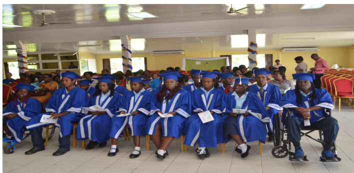
Graduates from Open Doors Centre