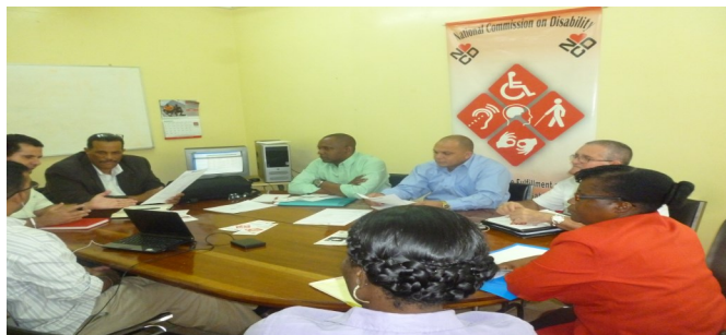
Cuban Delegation & NCD Representatives on March 12, 2015