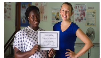
Nurse & Peace Corps Volunteer

Cheshire Home was established in 1972 as a home for persons with severe disabilities. A total of 25 residents currently occupy the home.