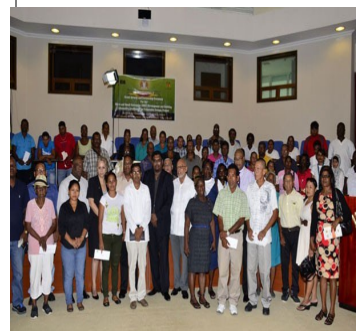
President Donald Ramotar & Grant Recipients

To date, over nine hundred (900) clients have accessed training and eighteen (18) have benefited from the low interest (6 % per annum) mutual guarantee facility, totalling Ninety Five Million Dollars (G$95,000,000). More than Sixty (60) Grants of approximately Twenty Million (G$ 20,000,000.00) have been approved for disbursements, according to SBB.