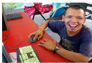
Resident using computer

would have been try to restrain them, but what an Occupational therapy room does is to provide