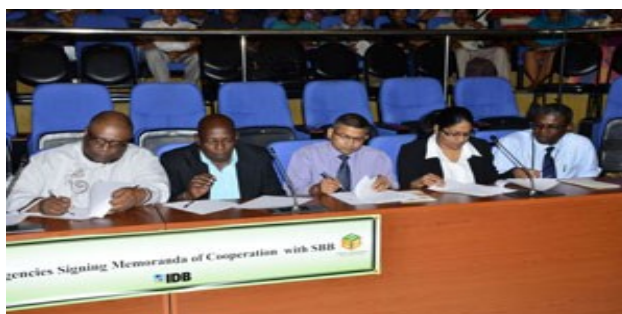
Signatories of the MOU ( Deeds Registry, GRA, NIS, Republic Bank (Guy) Ltd & GBTI on January 30, 2015 )