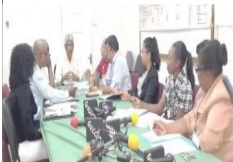
NCD Representatives & GECOM Officials on January 8, 2015 Meeting