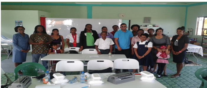
Project Coordinator, Facilitator & participants on Jan. 20, 2015

The Ministry of Education continues to work assiduously to ensure inclusive education is delivered to Persons with Disabilities throughout Guyana.