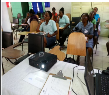
Participants on February 6, 2015 Sensitization session

The National Commission on Disability continues to promote the Rights of Persons with Disabilities through sensitization sessions with supervisory level staff of various agencies.